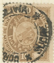
Sucre - dateless