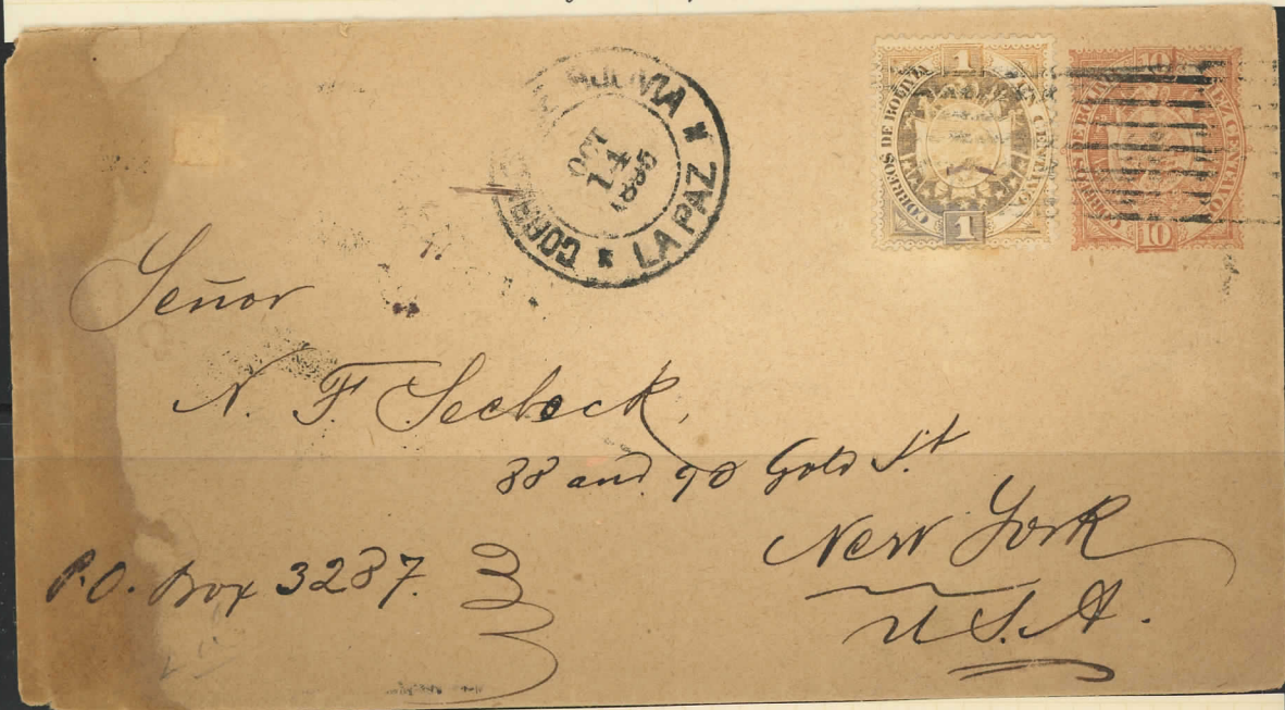
1c. Paris print making 11c. rate to New York via Callao, Peru, La Paz 140c.95 Callao 210c.95