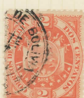
LA PAZ c.d.s. Type 2. (double outer circle)