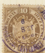
ORURO c.d.s in violet or blue