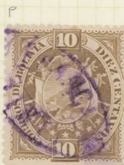
SINTI OR CINTI (= CAMARGO)