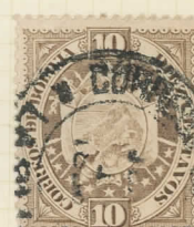
LA PAZ c.d.s. Type 1 (single outer circle)