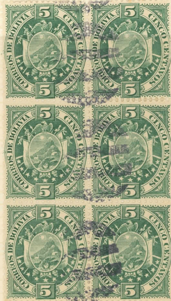
blocks showing the complete cancellation.