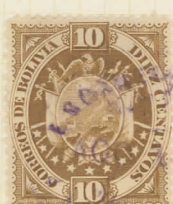
Cochabamba (1st type?)