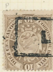
Boxed - LA PAZ