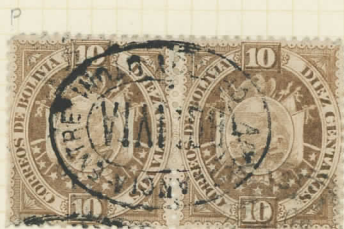
AMBULANCIA ENTRE ORURO Y UYUNI

Numeral cancellation incorporating town name (which is seldom on the stamp)