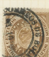
Cochabamba c.d.s. Type 1.