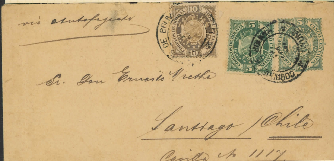
1894 cover, 20c (double rate) from Uyuni to Santiago, Chile, via Antofagasta. Uyuni 14.0c.94. Antofagasta 160c.94. Santiago 250c.94 CONDON PRINT