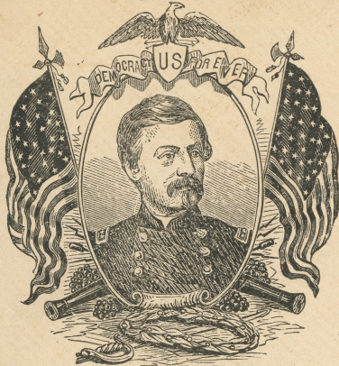
Gates & Gamble, Cin.

For President, GEN. GEORGE B. McCLELLAN. For Vice-President, GEORGE H. PENDLETON.